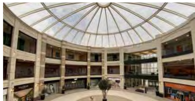
Galerija Belgrade, Serbia.